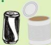
Cans and Tins